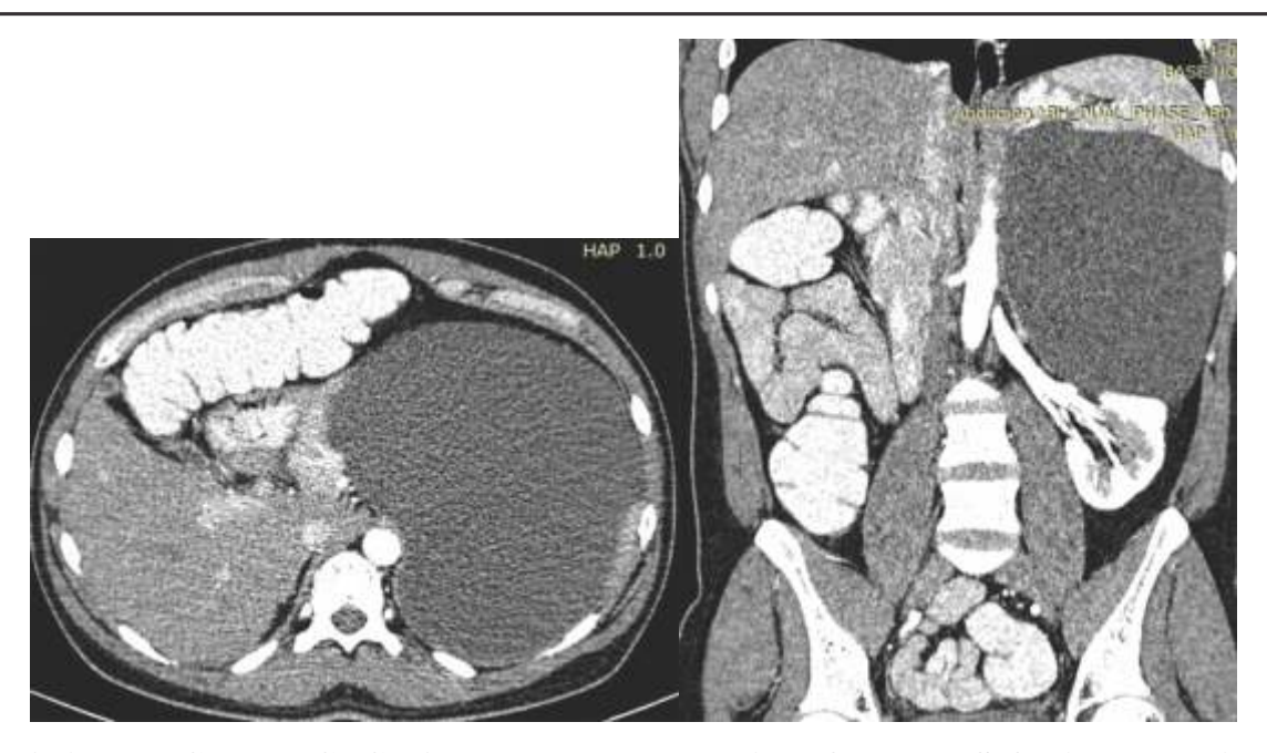
Fig. 3: Axial and Coronal CECT Abdomen Demonstrating of a Large Soft Tissue Density Mass with Fluid Density Contents in the Left Abdomen Involving the Peritoneal and Retroperitoneal Space of Left Causing Displacement of the Stomach and Pancreas to Right. Left Adrenal Gland is Pushed Medially with Non Visualized Lateral Limb. Left Kidney is Displaced Inferolaterally